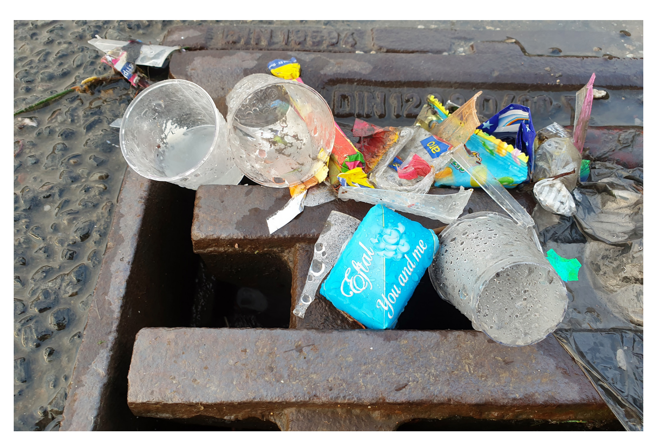
Wind and rain carry carelessly discarded plastic products and packaging into waterways via street gutters.

plants and street drainage systems in the municipalities of Aachen, Roetgen, Simmerath and Stollberg. Surveys and a laboratory experiment support the analyses. Based on these findings, proposals for environmental policy instruments to prevent these plastic waste inputs are being developed.