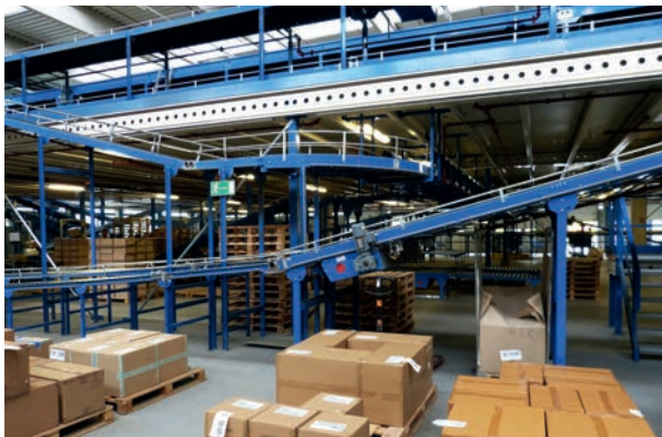
More and more textiles are purchased by mail order. This leads to an increased volume of packaging.

The project partners examine the following product groups: foods, textiles, office supplies as well as cosmetics, hygiene, detergents and cleaning agents. With the help of ecological, social and economic analyses of the innovations, they identify successful examples in the respective sectors.