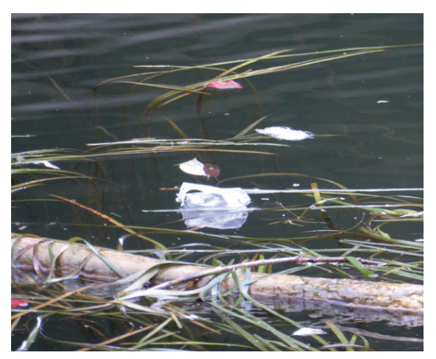
Plastic garbage in a still water zone on the Danube

From analyzing the various scenarios, the project partners will derive promising strategies to reduce plastic pollution in river basins. This could form the basis for future planning and legal requirements. In practice, this can benefit stakeholders such as associations of water and wastewater management, industry and agriculture, competent authorities as well as water supply and wastewater treatment companies.