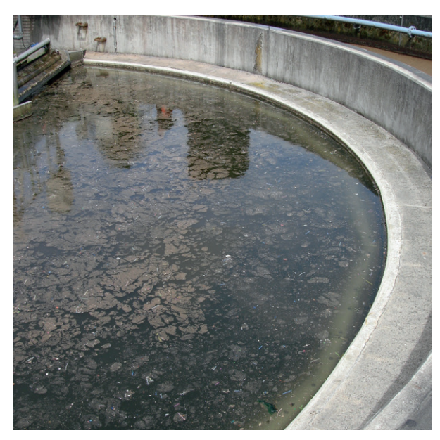
Plastics in the wastewater treatment plant after a heavy rain event

To assess the effectiveness of technical processes for retaining plastics in wastewater treatment, investigations are being conducted for the different treatment stages of conventional wastewater treatment plants: inlet, screen, grit trap, pre-clarification, activation, secondary clarification and effluent. The other discharged material flows, such as sewage sludge, are also sampled and analyzed. Additionally, the researchers are collecting and evaluating the discharge from wastewater treatment plants using advanced processes for solids separation, e.g. spatial filters, microsieves or membrane aeration, on several large-scale plants in Germany. They intend to further develop these technical systems with comparative studies on a semi-industrial scale.