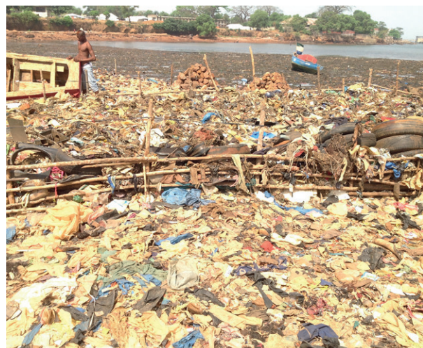
Plastic waste in Sierra Leone that is washed into the oceans during the rainy season.

KuWert thus tackles this problem at its core. The concept is to create incentives for collecting the plastic waste produced in households and industry through new local recycling options to prevent leakage into the environment and the oceans. In addition, valuable secondary raw materials are obtained. The mobile nature of this form of waste treatment allows ports on international trade routes to be served making it possible for the waste to reach international recycling markets. The researchers also want to investigate whether it is technically and economically feasible to produce and market products such as piles, paving stones or roof tiles from plastic waste in the target countries themselves.